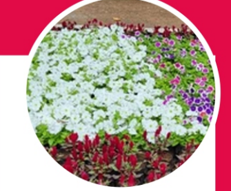
Exotic and Flowering, Fruit, Indoor-Outdoor Plants Different types of Palms & Creepers